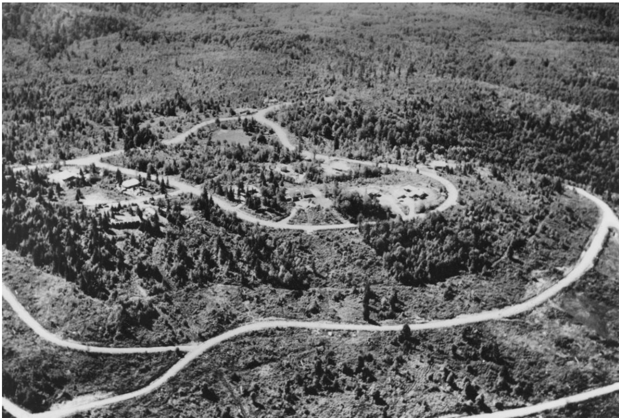
Aerial photo of Hilltop with Horizon View at bottom (1995.12 File #62)

Perhaps it was the Army surplus weapons carrier that made it possible; it certainly helped. The weapons carrier (somewhat like a huge jeep) was the one and only means—aside from bush-whacking on foot---that George and Roberta (Bobbie) Farmer had of getting up to their acreage on the hillside lying just south of present-day Eastgate. They bought their first parcel of 540 acres in 1945, knowing that the Eastside was ripe for development after the opening of the floating bridge across the lake in 1940. At the time the few homes in the area were up on Cougar Mountain, accessible by the only road over the mountain from Newport Way, now 164th Ave. S.E. A rough track connected Highway 10 (today's I-90) to Newport Way at what is now 150th Ave. S.E. A rifle range existed near Newport Way.