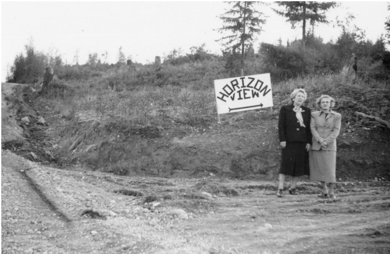
Two women standing with sign reading "Horizon View" (2014.052.026)